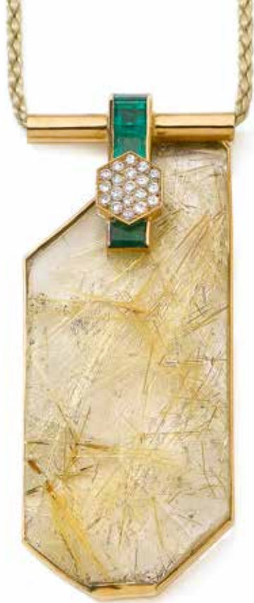
256 A RUTILATED QUARTZ, EMERALD AND DIAMOND 'ANGEL HAIR' PENDANT, BY JEAN VENDOME, CIRCA 1990

The large collet-set abstract plaque of rutilated quartz, with tubular surmount with calibré-cut emerald highlights, applied with an octagonal plaque pavé-set with brilliant-cut diamonds, suspended from an intertwined cord, diamonds approx. 0.95ct total, French assay mark, maker's mark, length 10.0cm