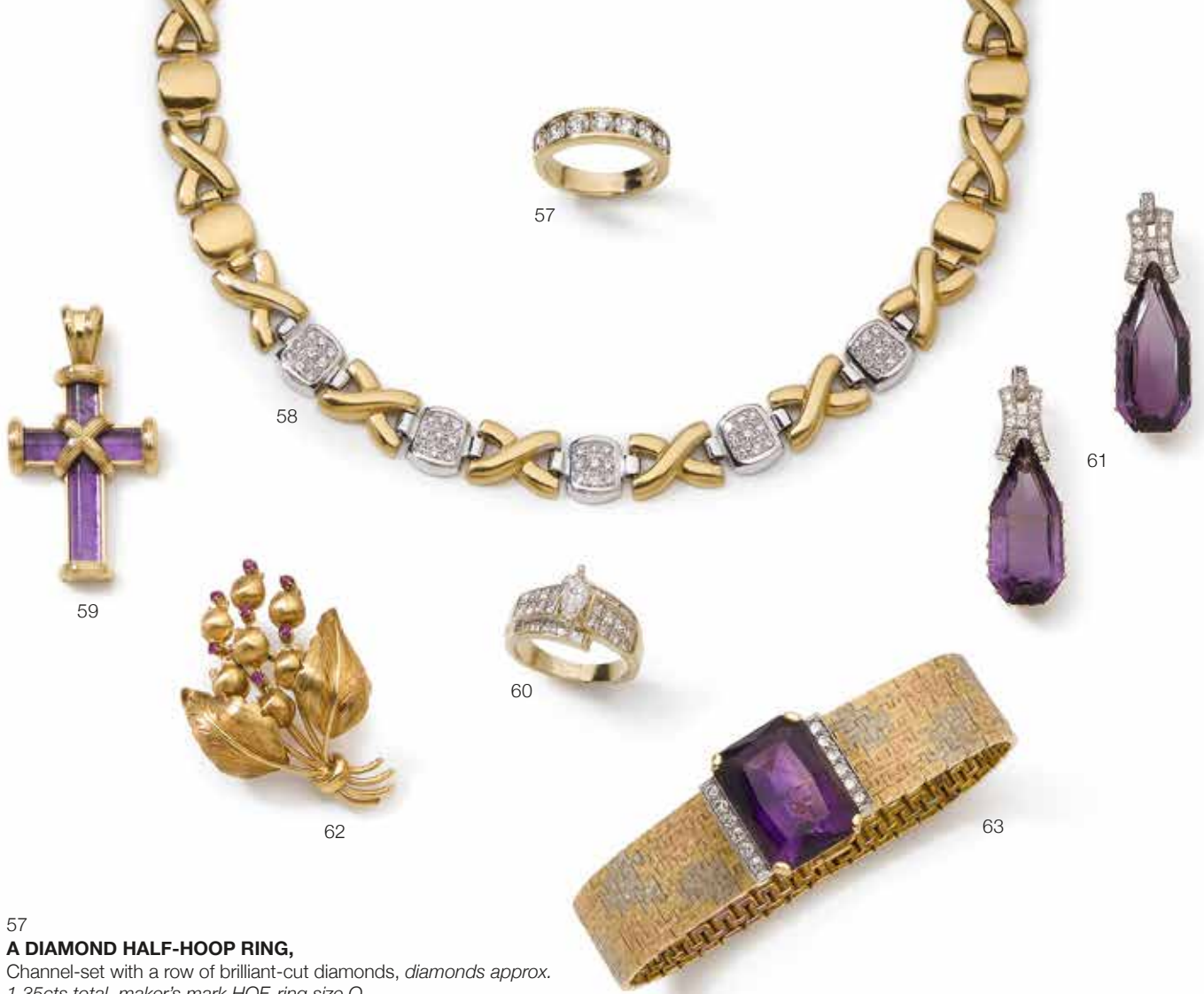
57 A DIAMOND HALF-HOOP RING, Channel-set with a row of brilliant-cut diamonds, diamonds approx. 1.35cts total, maker's mark HOF, ring size O